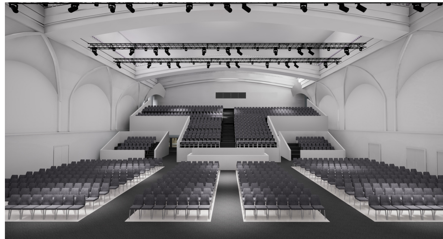
950 SEAT SANCTUARY

Step 2 of the Beyond Project is to build the first two floors of the Becoming Center in the side parking lot of our Cicero campus, expand the number of sanctuary seats to 950, and finish the parking lot at our 4848 W. Belmont property.