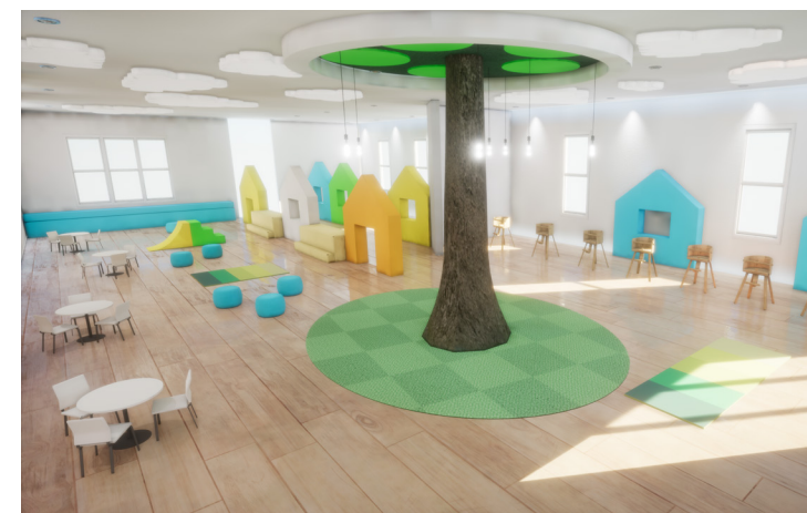
CT KIDS SPACES