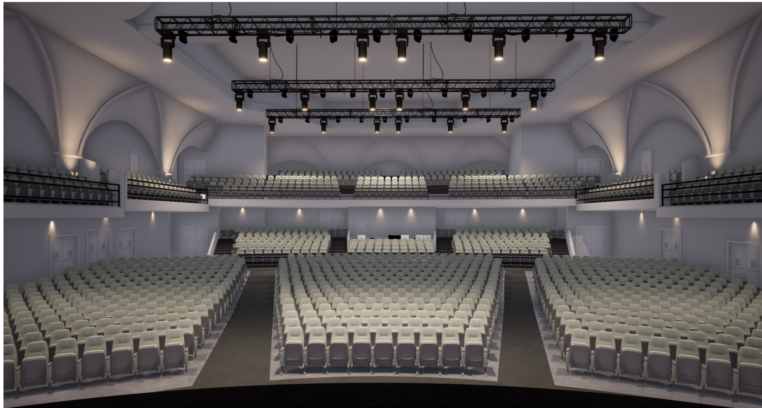
1,600 SEAT SANCTUARY