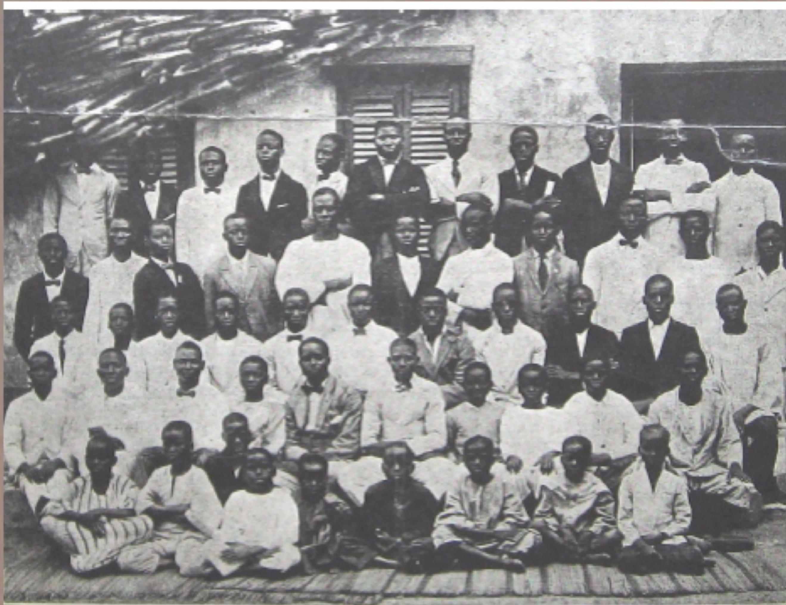
MEMBERS OF FAITH TABERNACLE LAGOS, NIGERIA WEST COAST AFRICA

When the Spanish Flu pandemic in 1918 shut down churches in Nigeria, an Anglican deacon launched a prophetic movement and healing ministry that became the Christ Army Church, igniting revivals over the next few decades.